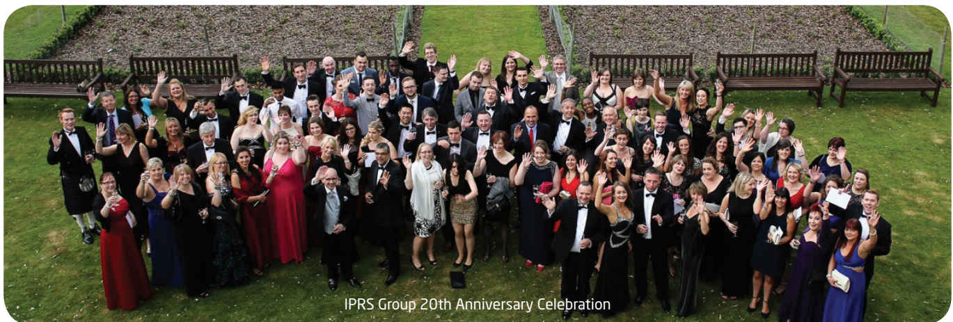
IPRS Group 20th Anniversary Celebration

Personal Functional Assessment Services (PFAS) - undertaking PIP assessments on behalf of the DWP